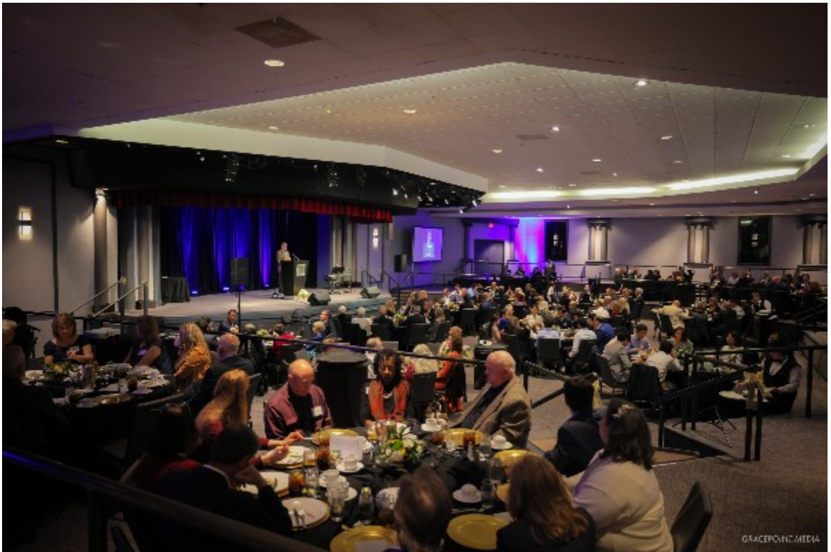
200 friends gathered in the Malachite Showroom to help us celebrate God's goodness over 50 years of ministry.