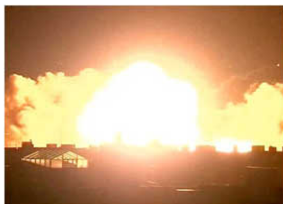
Bomb exploded in Munich

This was just one of tens of thousands of unexploded bombs that were dropped over Germany during the war and eventually buried, all of them posing a threat.